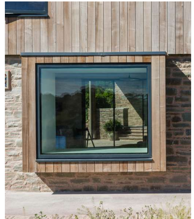
Far House Farm (2022) © Owen Hicks Architecture Image credit: OHA / Tom Glendinning Photography